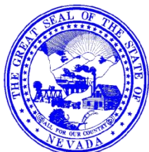
JOE LOMBARDO Governor

400 W. King Street, Suite 106 Carson City, Nevada 89703 (775) 684-7040 • Fax (775) 684-7052 http://minerals.nv.gov/